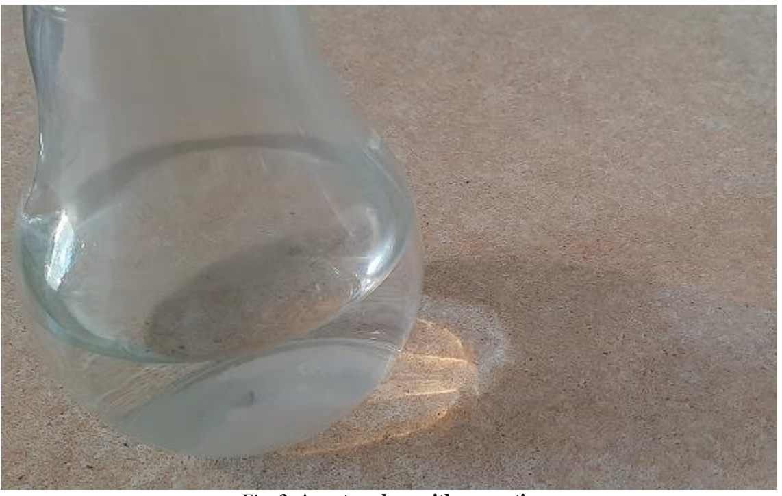
Fig. 2. A water glass with a caustic