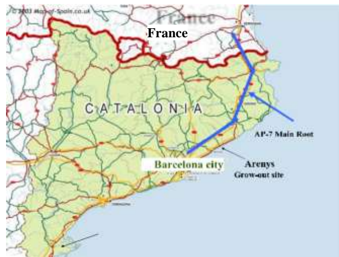
FIGURE 1. Pre-fattening

To run the operation at Arenys de Mar, the old cages will be removed and new moorings and net cages will be installed. PMter will purchase additional workboats and marine equipment. The site is well exposed to open sea waters; however, it still offers low waves and no tides. The site is referred to as open sea aquaculture and meets all relevant regulations for sustainable aquaculture.