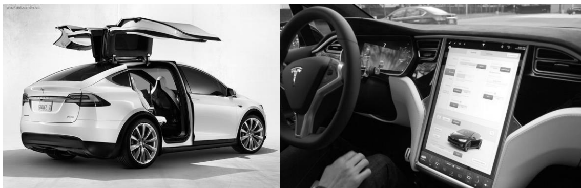
Fig. 3 - The model appearance and dashboard of Tesla Model X

The model comes in three versions, their currently known technical and tactical characteristics are summarized in the Table 3.