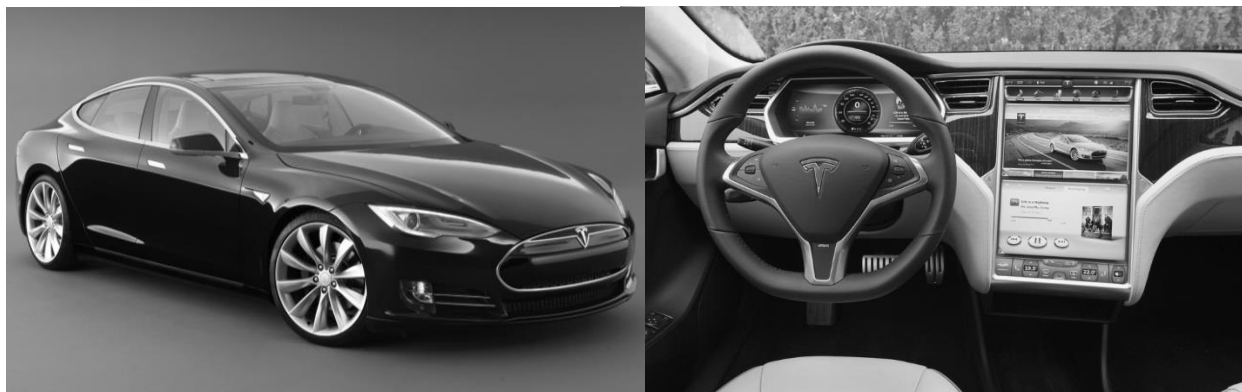
Fig. 2 - Model appearance and dashboard of Tesla Model S

The second model of the Tesla Motors electric car was the Tesla Model S (Fig. 2), presented by company in 2009 and subsequently recognized (according to the «Motor Trend» magazine, the USA) as the "Car of the Year 2013". In the USA, the first deliveries of Tesla Model S were launched in June 2012, in Europe - in August 2013 and in 2014 they started to be supplied to China.