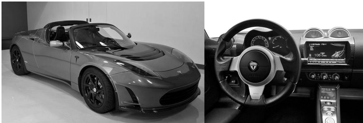
Fig. 1 - Model appearance and dashboard of Tesla Roadster 2.5 Sport

However the technical characteristics of the improved models remained unchanged.