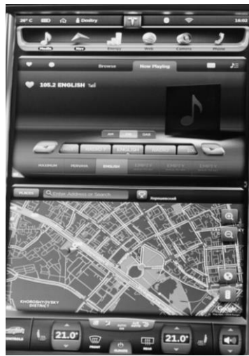
Fig. 4 - Application output of media player and navigation to the main display

The touch screen (Fig. 4) provides access to the functions of climate control, seats and windows heating, steering settings, audio / video devices, suspension, lighting, roof hatch or door locks, wireless connection to Google Maps, Pandora Music (Internet radio, where a user by entering the name of his favorite artist, can listen similar in style and sound composition), as well as all features of a real Internet browser.