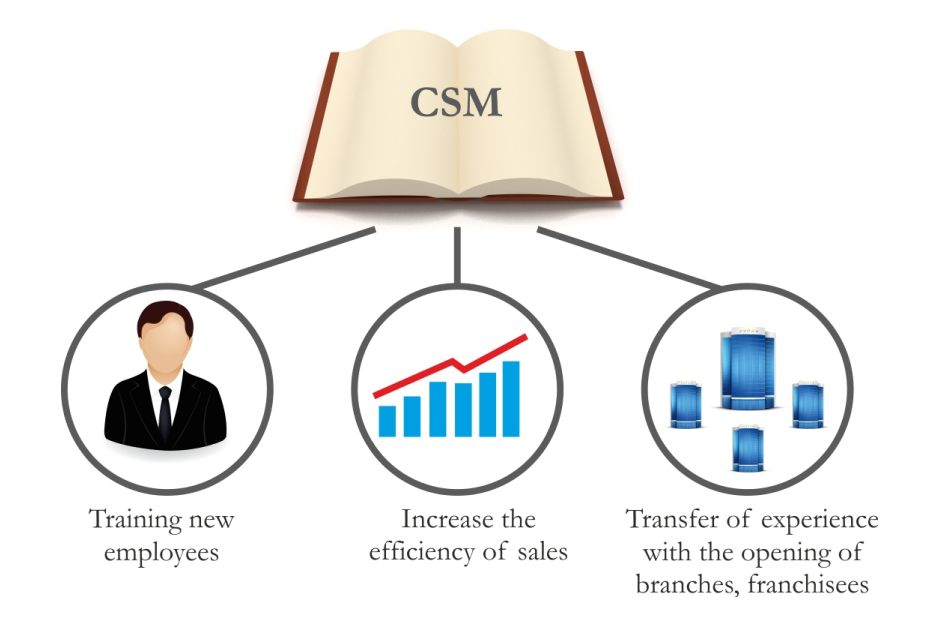
Fig. 1. The main objectives of the company which are solved by the CSM

Accordingly, to the enterprises for which the CSM will be useful belong: companies working in sales, with more than 15 employees, which operate on market for more than 2 or 3 years.