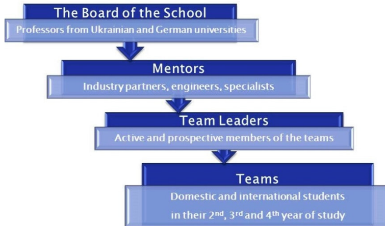
Fig. 1 - The Structure of the School

talented members of all the teams. These individuals, as a rule, lead a project or a group of projects as well as their corresponding team. Where the teams themselves consist of domestic and international students, who are involved in the processes of research, development and education.