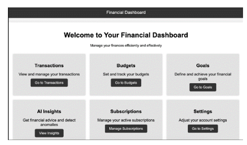
Fig. 5. Main page