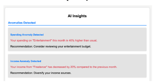
Fig. 6. Use of AI models for anomaly detection

Spring Cloud Gateway was chosen for its ease of configuration and ability to scale with the system, which is critically important to ensure continuous availability of services.