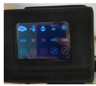
Fig. 3: prototype with environmental sensors